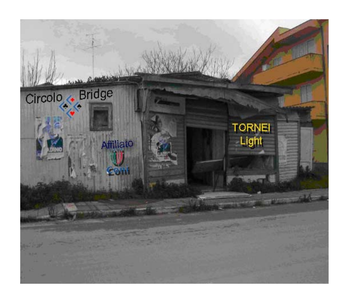
Un noto circolo di bridge in Italia