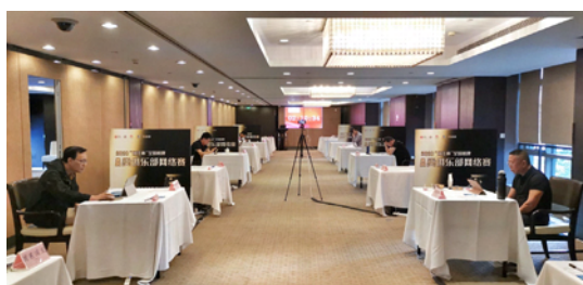
The Shanghai playing area: there were four clubs and 18 players.