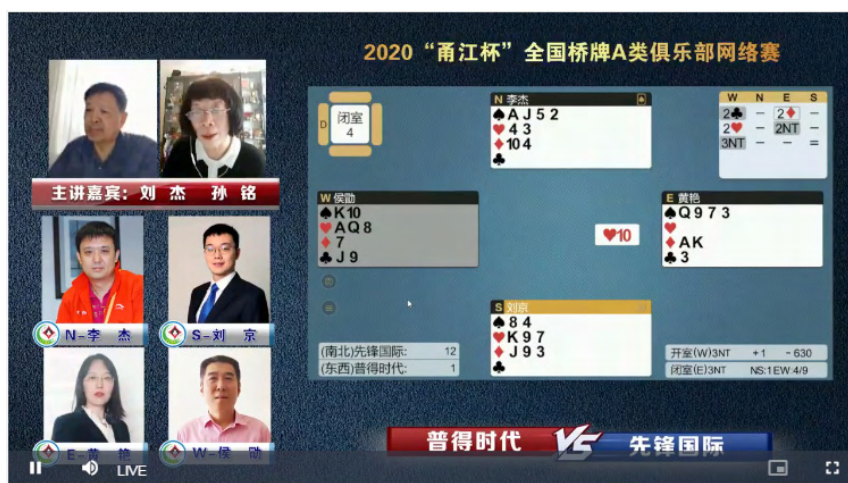
The live broadcast, with commentators.