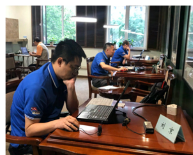
One of the Beijing sites, with three clubs and 11 players.