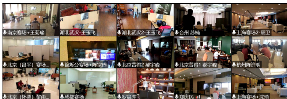
All of the playing areas, being videotaped by the CCBA.