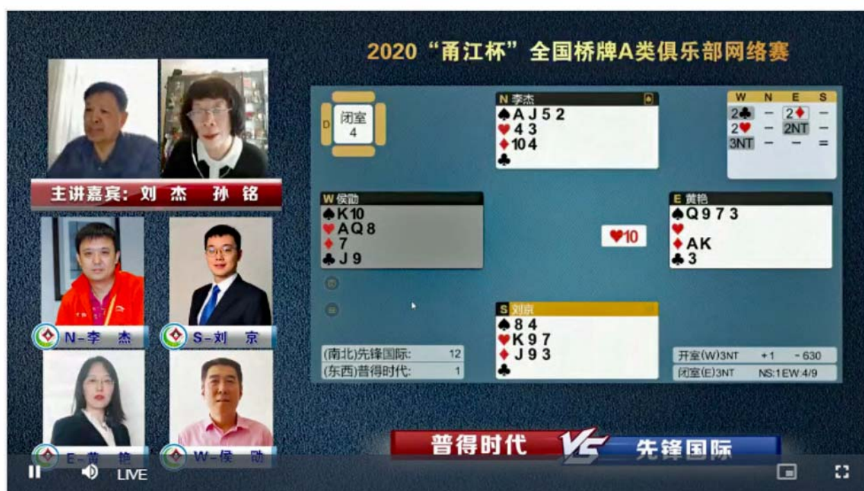
The live broadcast, with commentators.

A mio parere, EBL e WBF avrebbero dovuto darsi da fare per creare un unico software di gara per abbattere costi realizzazione e garantirne la massima funzionalità, ma non è detto!